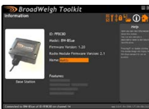
BW-Toolkit Software used to calibrate and configure your devices