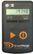
BW-HR Handheld Wireless Display LCD reading from an unlimited number of BroadWeigh shackles