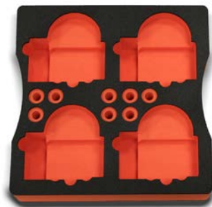
BW-INSERT (A) To fit 4 ¾ ton shackles