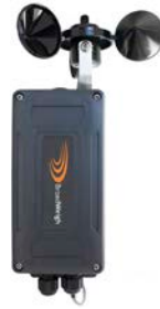
BW-WSS Wireless wind speed sensor