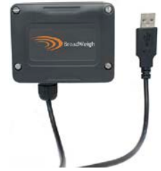
BW-BSue Extended range wireless radio telemetry USB Base Station