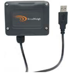
BW-BSue Extended range wireless radio telemetry USB Base Station