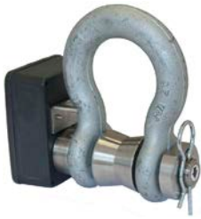
BW-S325 & BW-S475 Shackles BroadWeigh wireless Crosby Safety Bow Shackles