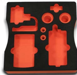
BW-INSERT (C) To fit BroadWeigh Accessories