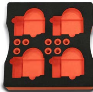
BW-INSERT (B) To fit 3 1/4 ton shackles