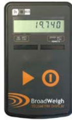
BW-HR Handheld Wireless Display LCD reading from an unlimited number of BroadWeigh shackles