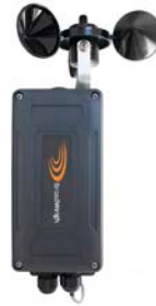
BW-WSS Anemometer Wireless wind speed sensor