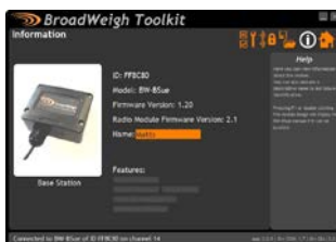
BW-Toolkit Software used to calibrate and configure your devices