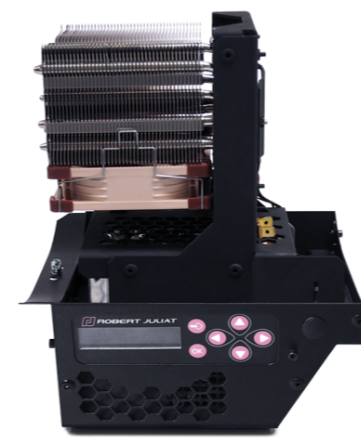
Module with optional display/keyboard